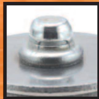
Increased Blind Side Expansion